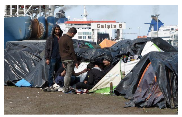
Men wait for the opportunity to stow away on a lorry