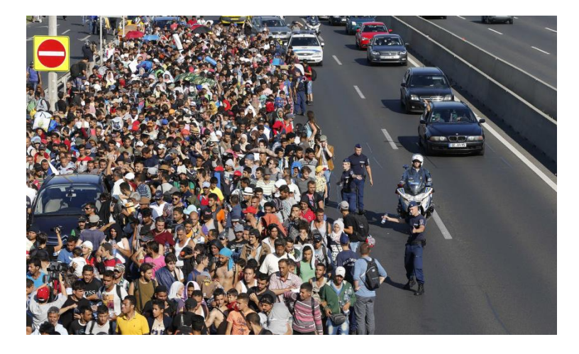
Migrants walking out of Budapest in the direction of Vienna